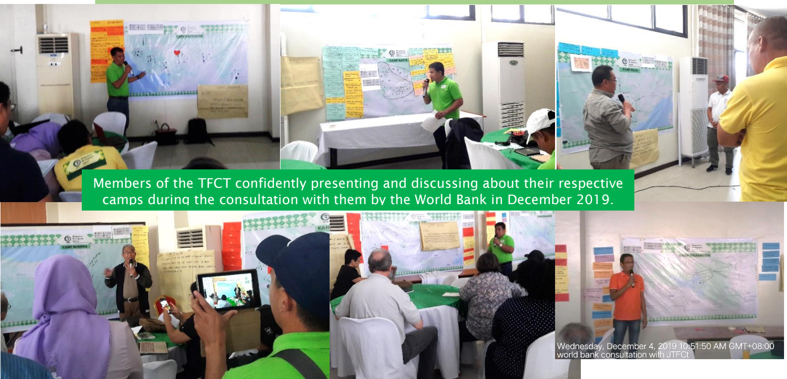
Members of the TFCT confidently presenting and discussing about their respective camps during the consultation with them by the World Bank in December 2019.